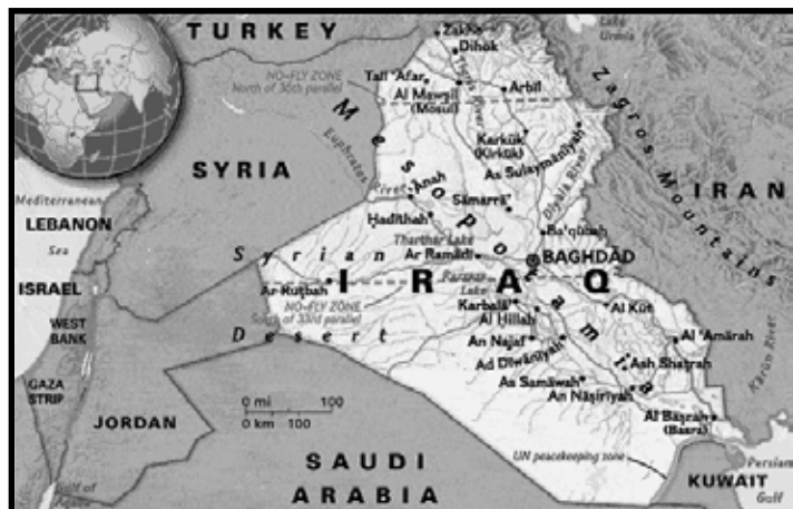
Map of Middle East.

In the aftermath of the Second Persian Gulf War (2003), sanctions were lifted and civil administrators appointed by the United States took over Iraq’s public sector. Many enterprises formerly owned by the state were privatized. By that time, however, the economy was in shambles, and the private sector was largely inexperienced. Moreover, oil production and economic development had both declined, the economy faced a huge foreign debt, there was a high rate of inflation, the oil sector had fallen behind the