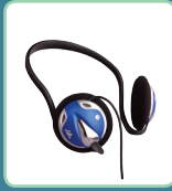
REAR WEAR HEADPHONE